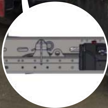
UNDERFRAME PIERCED LONGITUDINAL MEMBERS