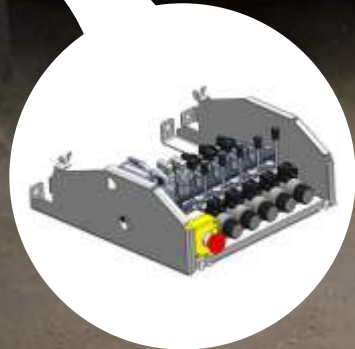
ELECTRO HYDRAULIC FLOW CONTROL WITH EMERGENCY LEVERS